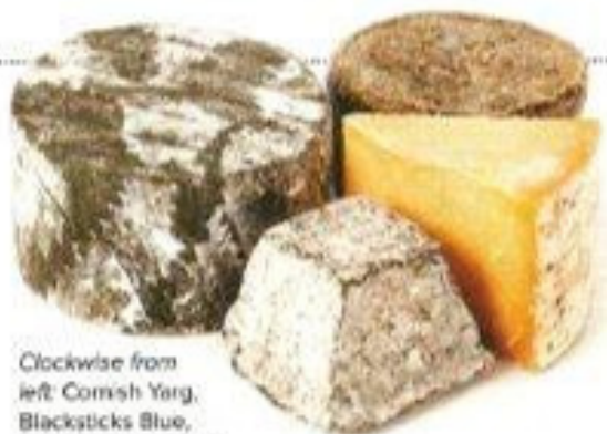
Clockwise from left: Cornish Yarg, Blacksticks Blue, Appleby's Cheshire and Tymsboro.